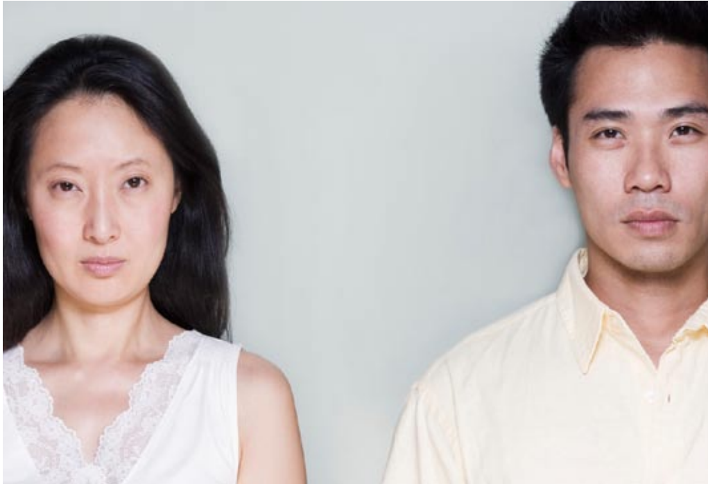
Understanding compelled tobacco reduction . . .